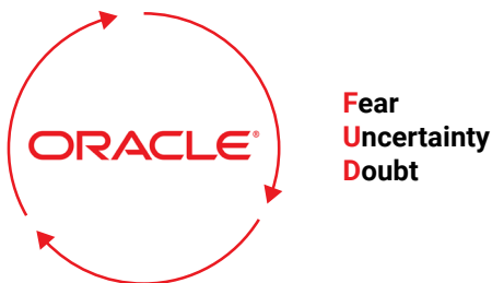
Figure 1: Oracle relies on “FUD” as a core part of their strategy.

If all this sounds scary, you’ve got the right idea. Oracle has positioned itself that way (see Figure 1). But it doesn’t have to be a nightmare. Using the information in this book will help shield you from what’s to come, so you can properly prepare both before an audit, and after that fateful day comes.